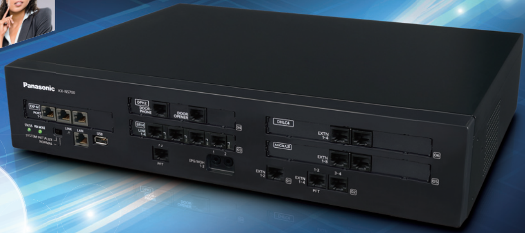
Smart Hybrid PBX KX-NS700

Concerns that come hand-in-hand with business We want to minimize initial costs. We want a future-proof system. We want a single unit with multi functions.