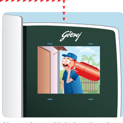
You see the visitor on your TV set